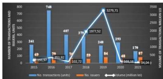
Figure 3. Evolution of BVM indicators, years 2015-2021, Source: Developed by the authors based on the data from the BVM newsletters [3]

It is worth noting that for the first time since the Exchange obtained the license of market operator, during the year of 2021 there were no transactions on the regulated market for a month, which led to equalizing the number of transactions on the regulated market (86 transactions) And in MTF (84 transactions). Transactions on PR took place between the period of January - April 2021, and may - November 2021, the volume of transactions had dropped sharply. The revival of the market begins in December 2021. On the other hand, the reverse is recorded in the MTF, where in the second half of 2021 takes place the market recovery, with registered transactions under the MTF of shares of issuers. Thus, the year 2021 was distinguished by diametrically opposed conjunctions for PR and MTF.