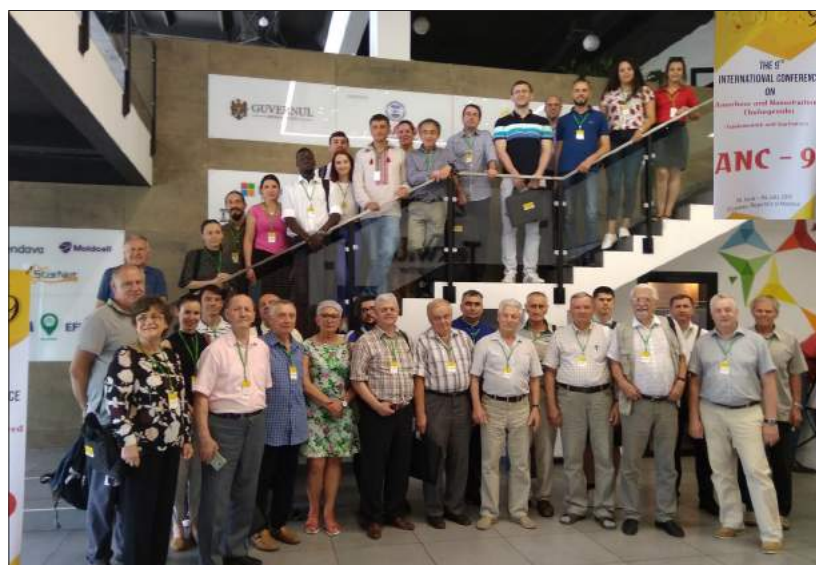
Figure 7. Group photo of International Conference on Amorphous and Nanostructured Chalcogenides, ANC-9, dedicated to the 85 anniversary of the Academician Andrei Andriesh. Chisinau, 1 July 2019.

6. Mott N.. Electrons in glass. Nobel Lecture, 8 December, 1977, Cavendish Laboratory, Cambridge, England.