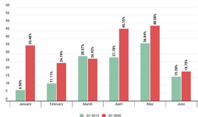
Fig. 3 Percent of the total number of DDoS attacks that affected educational resources: Q1 2019 vs Q1 2020 [3]

Threat analysis in HEIs is a very important research area, according to the report submitted by ENISA [10], in 2020, educational field has been targeted by cyberespionage campaigns due to interest in COVID-19 research results. An additional confirmation is the data reported by Kaspersky [3], which reports an increase in DoS / DDoS attacks by 350%, compared to 2019, attacks targeting educational resources, much of the increase is due to distance learning services.