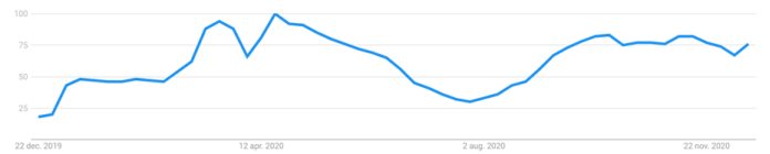
Fig.2 Global interest level for Moodle 2019-2020 (by Google Trend)

Analyzing the data provided by Google Trend, for the period 2019-2020, there is a massive increase of interest in various LMS platforms, both in Europe and globally. It is also attested that Moodle is the most popular LMS.