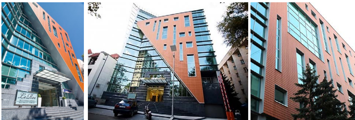
Figure 15. "Contradiction" - Le Roi Business Center, 2008.

In turn, "contradiction" is inevitably associated with the modernist direction of such newest styles as high-tech, deconstructionism, pragmatism, etc. This direction is the most attractive for modern Moldovan architects, as it creates the greatest opportunity for self-expression and the search for a new form. At the same time, it is an area of maximum risk and increased responsibility of the architect when it comes to the construction of new objects in historical city center (Figure 15).