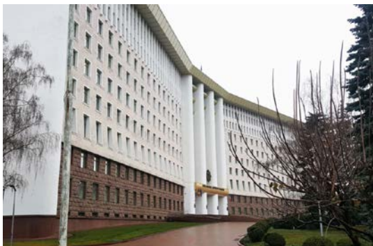
Figure 5. Parliament of RM, 1976.

Since the architectural community was engulfed in a new wave of rethinking the imagery and expressiveness of buildings, the architecture of this period traces the characteristic features of postmodernism, indicated by Charles Jenks: historicism, traditionalism and an attempt to appeal to local architecture [17].