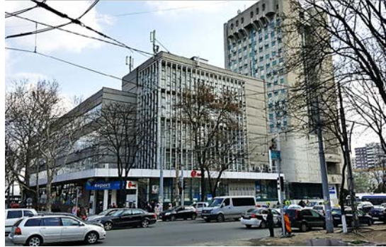
Figure 4. Moldtelecom, 1967.

One of the main contradictions of this period was the stylistic and compositional confrontation between the “old” and “new” architecture, which appeared in the historical center of the city, in violation of previously adopted architectural and compositional principles.