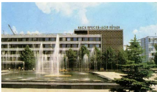
Figure 1. Press House, 1967.