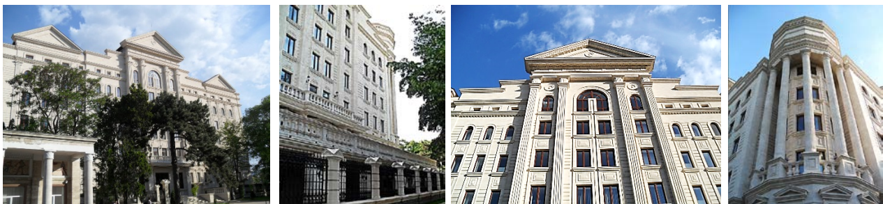
Figure 13. "Convergence" - ASCOM Group Office Center, 2012.

The tendencies in the development of the architecture of administrative buildings indicated in this way reproduce the essence of the processes taking place today in architectural design, development and reconstruction of the city of Chisinau. They demonstrate the heterogeneity and diversity of approaches to the architectural and compositional solution of objects of the studied typological group. Each of the identified trends has a certain stylistic binding or preference, reflecting its character and essence [12].