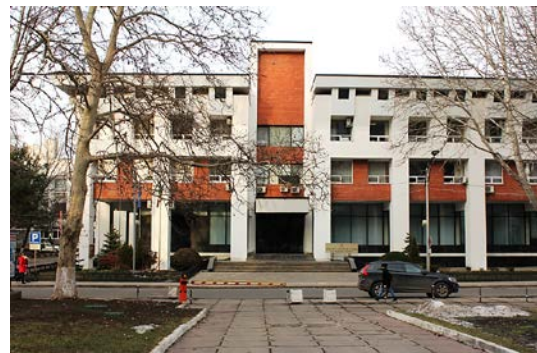
Figure 6. Ministry of Foreign Affairs and European Integration of RM, 1977.

For this purpose, the techniques of architectural and planning decisions of administrative buildings were improved [14]. Together with the free location on the site, the buildings received a composition of blocked volumes, reflecting the complicated scheme of functional zoning (the Central Committee of KPM - today Parliament of the