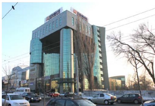
Figure 9. Accent Electronic Business Center, 2007.