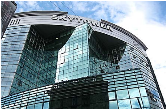
Figure 11. SKYTOWER Business Center, 2007.