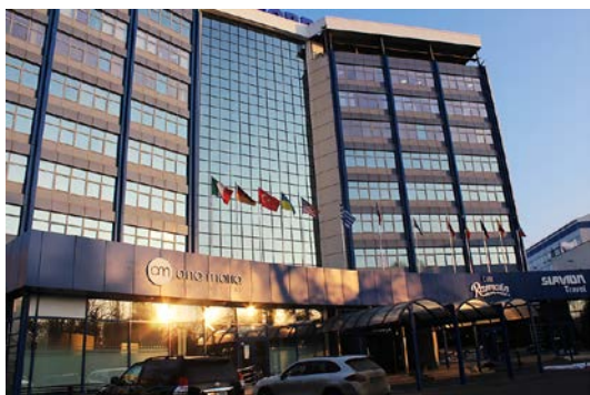
Figure 7. KENTFORD Business Center, 1978.