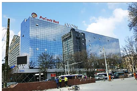
Figure 8. JSC - IPTEH Business Center, 1974.