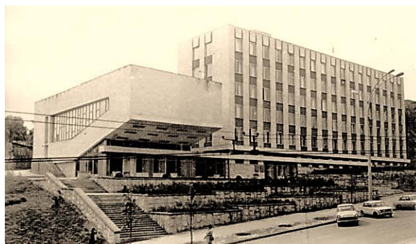
Figure 2. District executive committee, 1969.

The creation of new architectural forms was dictated primarily by standardization and typification in construction, caused by the need to save money and resources [6]. New principles of architecture of administrative buildings were approved, based on the rejection of historicism, simplicity of forms and the need to reflect in the image of a building its functional purpose and constructive solution (House of Technics - today House of Science and Technology, 1968, architect V. Zakharov). The consequence of this was the development of new urban and architectural planning techniques [9].