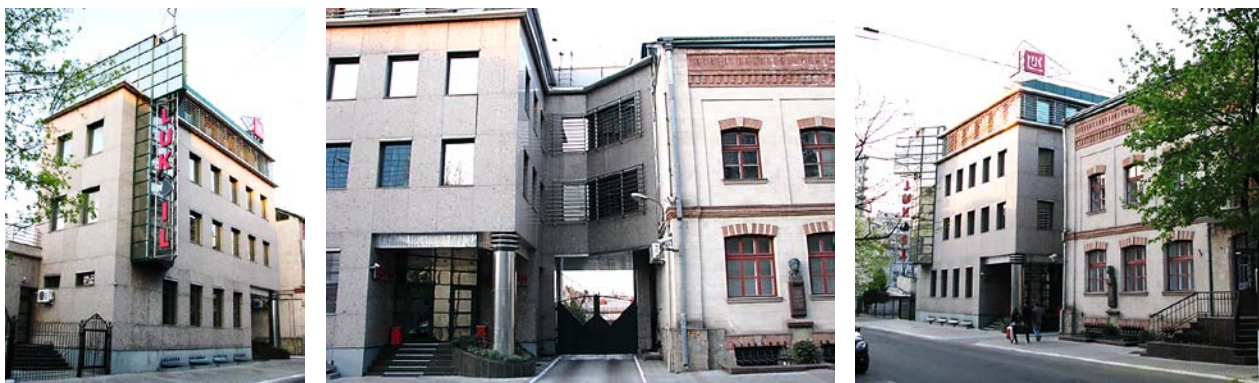
Figure 14. "Reminiscence" - headquarters of the company LUKOIL-Moldova S.R.L

"Reminiscence" is postmodern stylistics, winding the memory of the context or implicitly quoting it. This direction gives more opportunities for architects to show their own views on the architectural work they create, designed on the basis of analysis of existing context. Thus, the architecture of "reminiscence" is a manifestation of respectful attitude to the environment, an analytical approach to the design process, and professional solution of the assigned tasks.