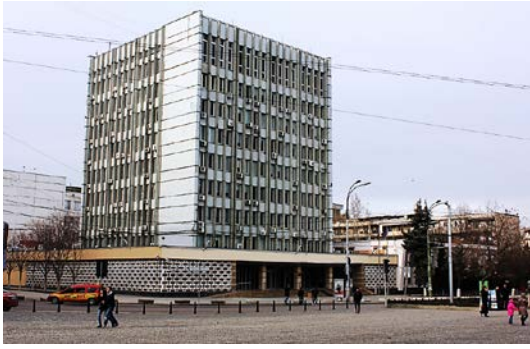
Figure 3. National Bank of RM, 1973.